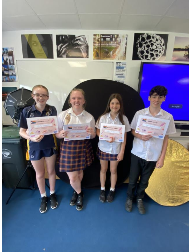
3 - Year 8 Bake Off winners