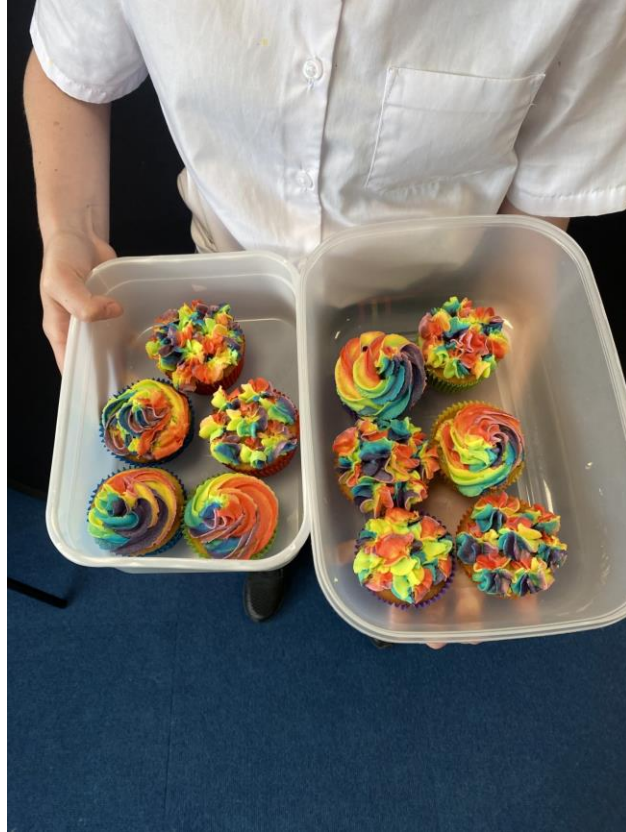
5 - Bake off cakes