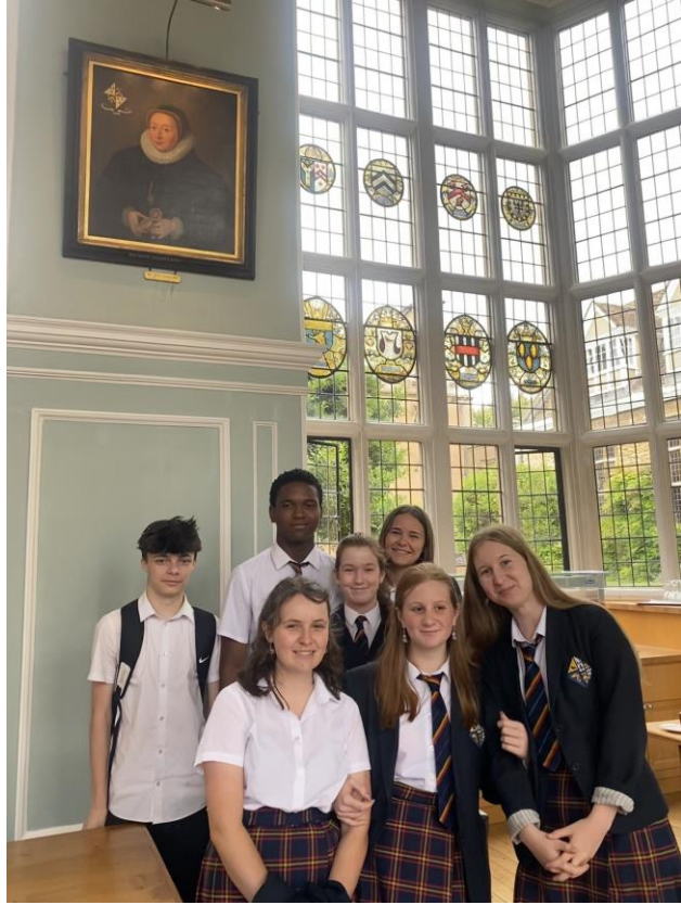
8 - Year 10 pupils at Cambridge University