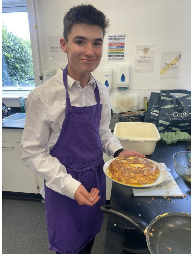
7 - Spanish Tortilla