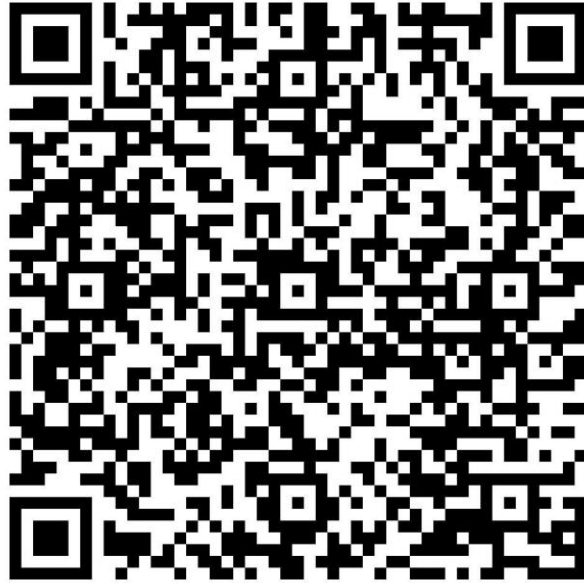
2 - QR Code