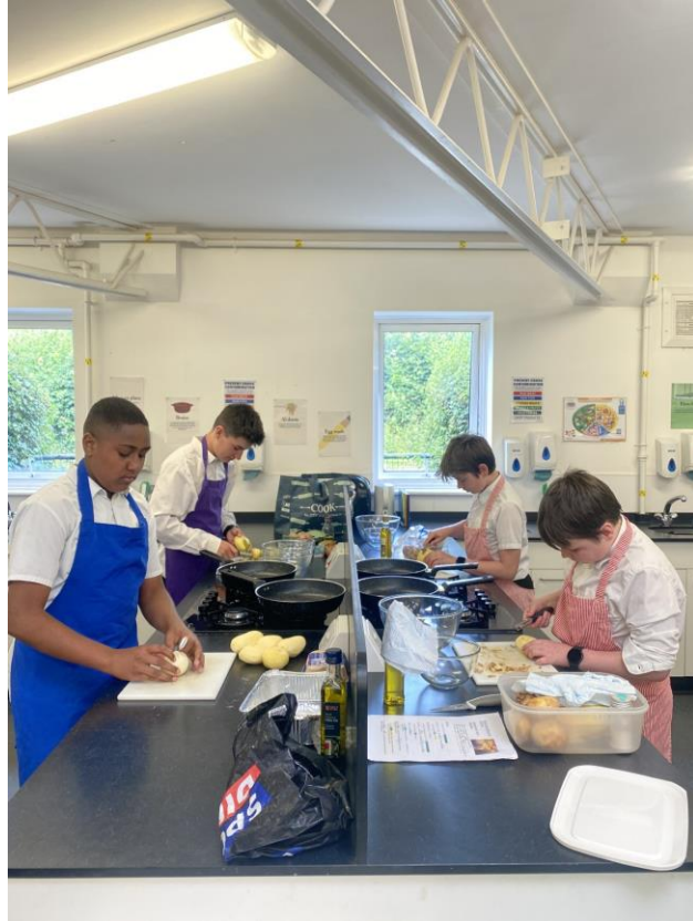
6 - Year 8 Spanish Tortilla master class