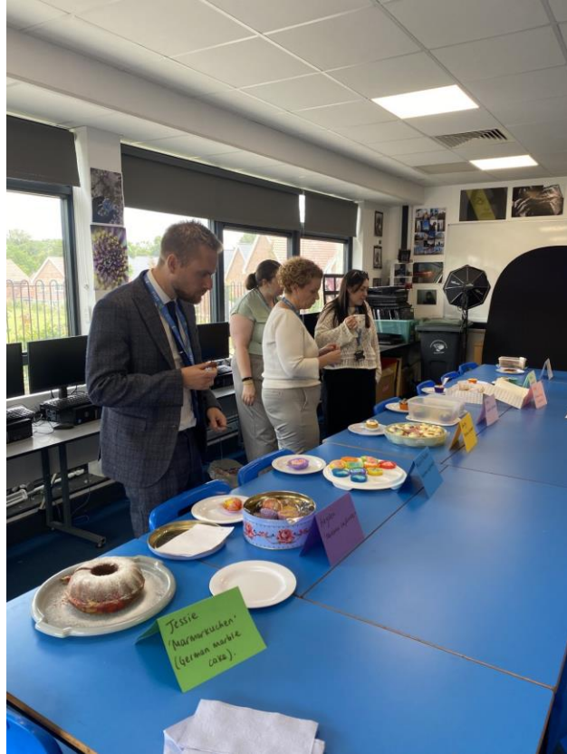
4 - Bake off judging