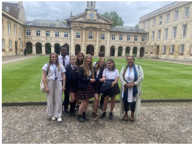
9 - Year 10 pupils at Cambridge University