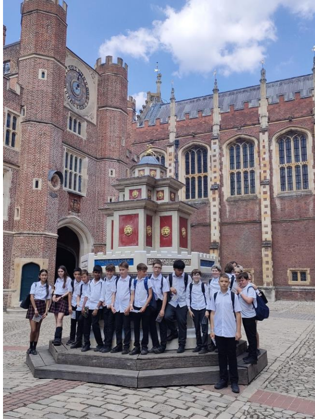
9 - Year 7 pupils at Hampton Court