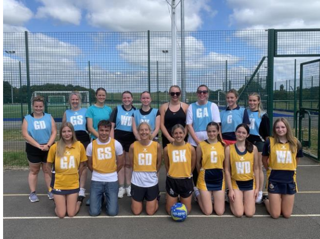
4 - Old Newportonians v the Academy netball match