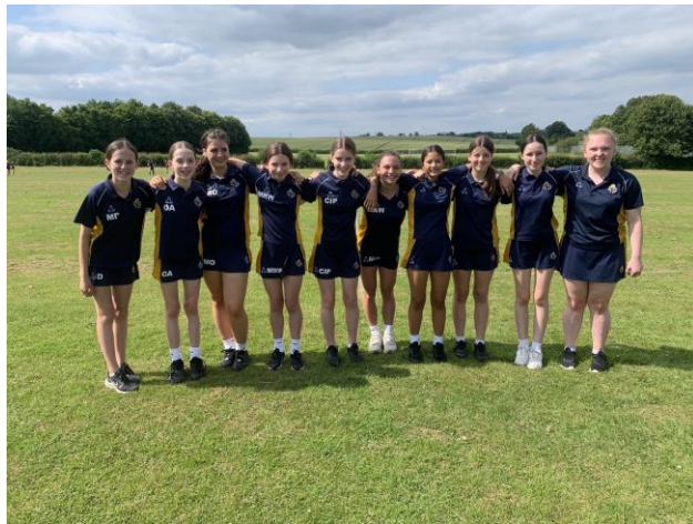
5 - Year 7 and 8 Rounders