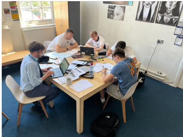
8 - Math's revision