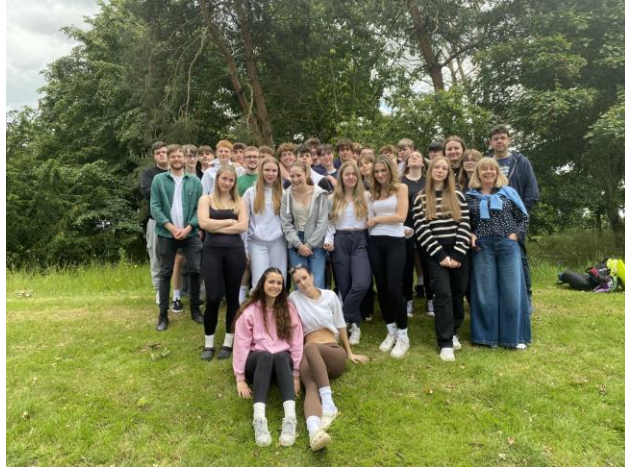
7 - Sixth form UCAS trip