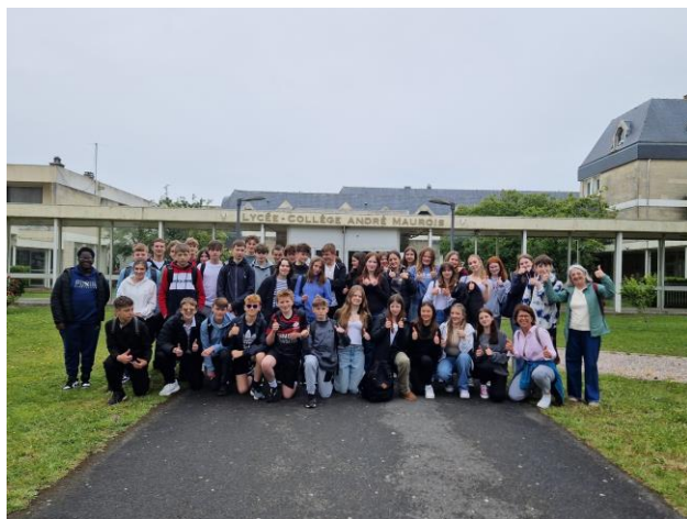
6 - French Trip