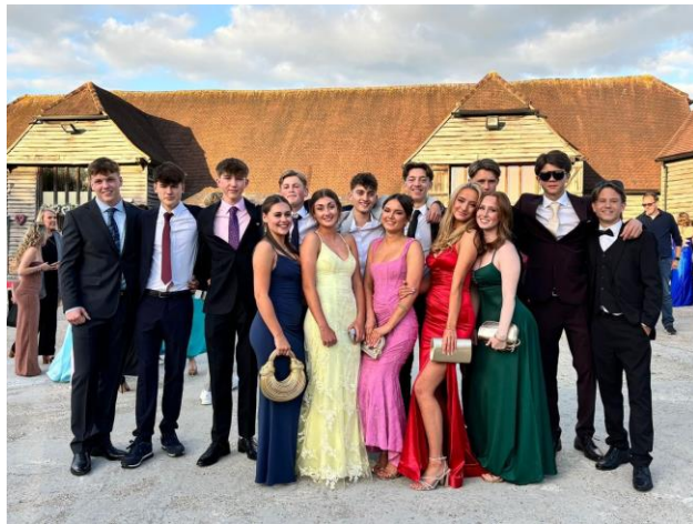
4 - Year 11 Celebration event