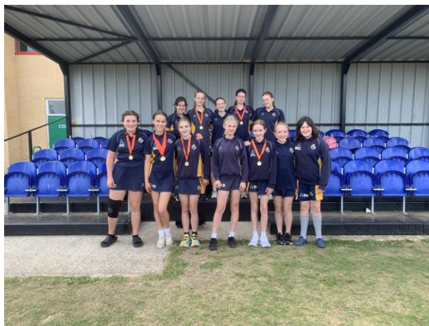
8 - Years 7 & 9 athletics