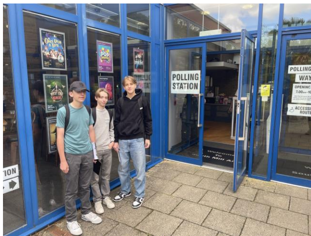
5 - Year 10 work experience