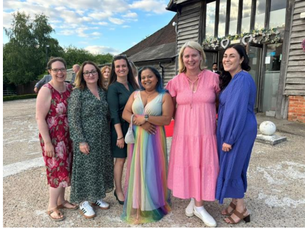
3 - Year 11 Celebration event