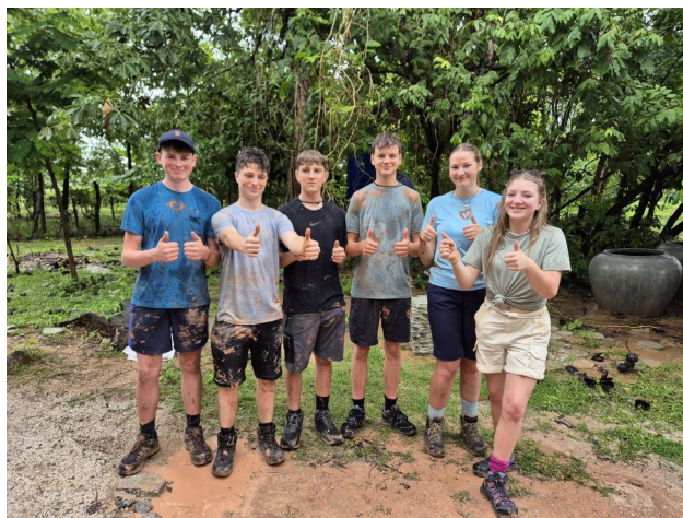
5 - Cambodia Trip