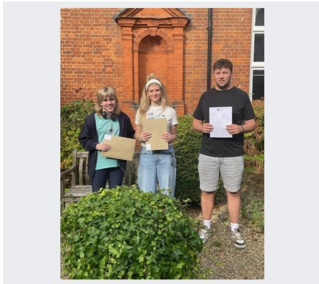
2 - A Level results day