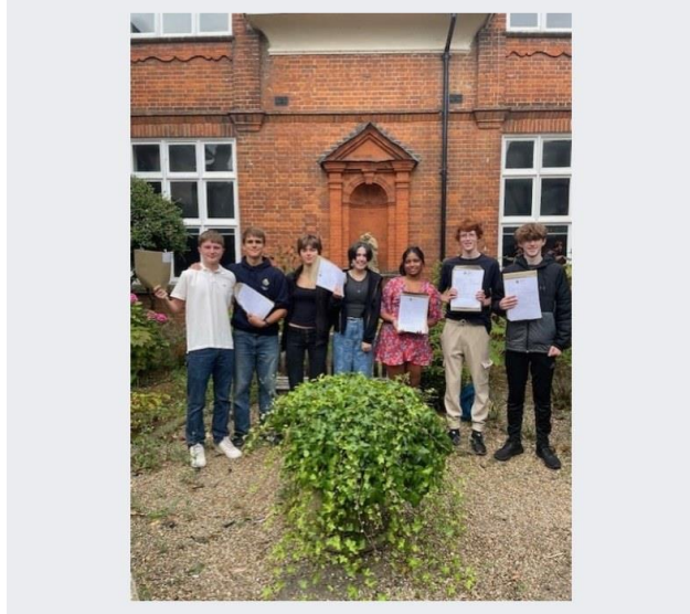
1 - GCSE results day