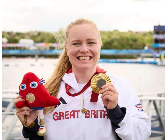
6 - Laura Sugar

This week we would like to celebrate the exceptional achievements of an ex-pupil Laura Sugar who won another Olympic Gold Medal at the Paralympic Games in Paris. A second gold medal is one thing, but a paralympic record in the women's canoe sprint is going up another level! At school, Laura was always a credit to our community and now she is a credit to her country and Paralympic sport more broadly. Laura is an inspiration to the pupils that attend our school now and will be for the future generations who wear our school badge, confident in the knowledge that they too, can achieve greatness just like Laura.