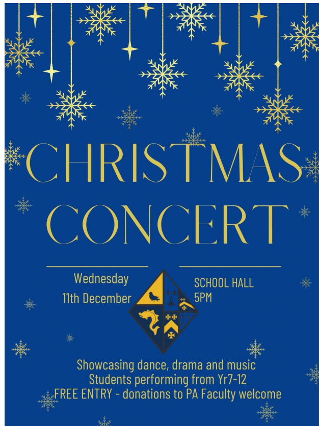
13 - Christmas Concert