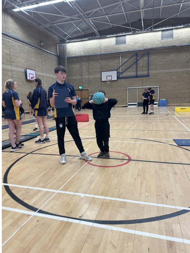
10 - Primary schools event