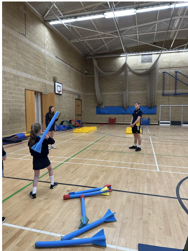
9 - Primary schools event