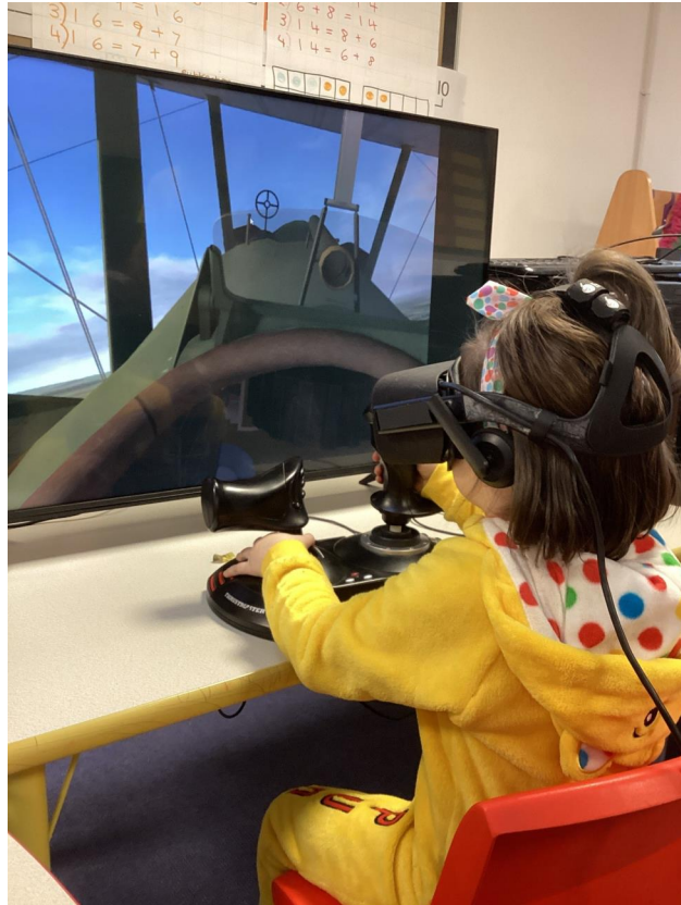
4 - Wimbish pupils flight simulator experience