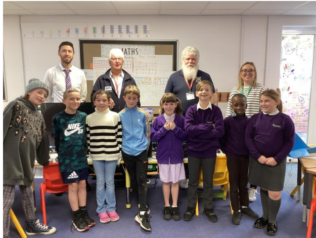
3 - Wimbish pupils flight simulator experience