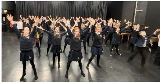
11 - Charlie and the Chocolate Factory rehearsals