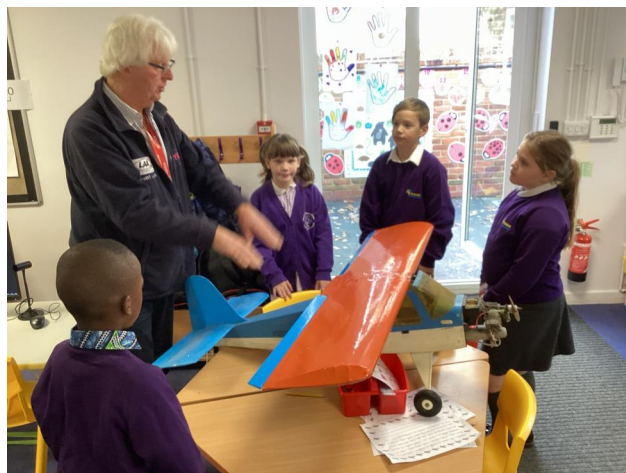
5 - Wimbish pupils flight simulator experience