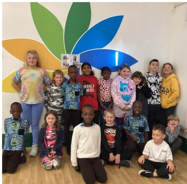
1 - Wimbish Primary Academy pupils

Children in Need: Wimbish pupils also took part in a non-uniform for BBC Children in Need! Thank you to all our families who have donated to this wonderful charity