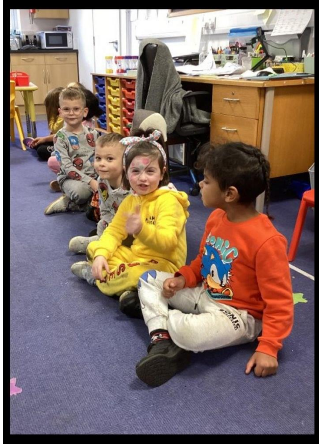
2 - Wimbish Primary Academy pupils