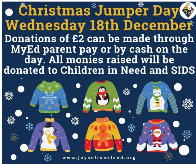
8 - Christmas Jumper day