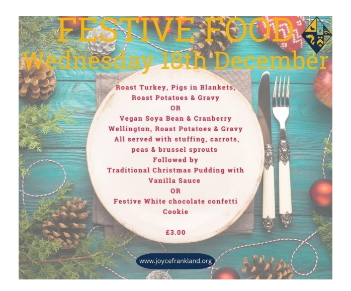
2 - Christmas Menu