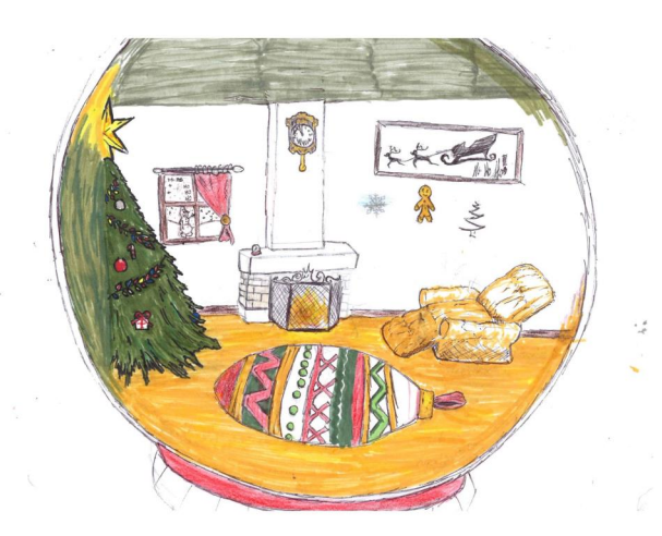
11 - Caleb Year 9