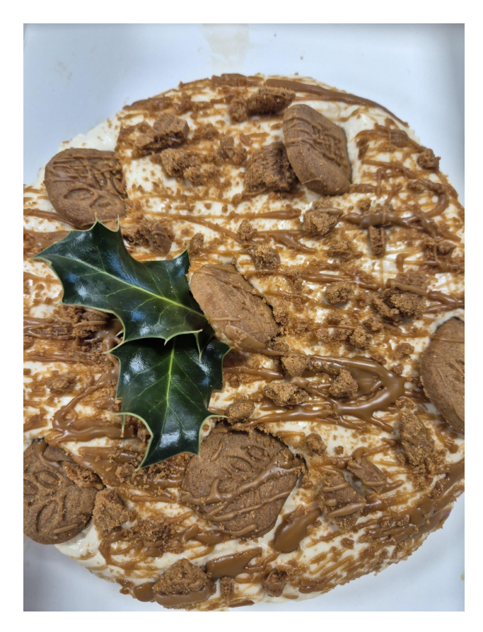
8 - Bake Off