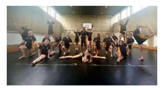
4 - Cheerleading Club