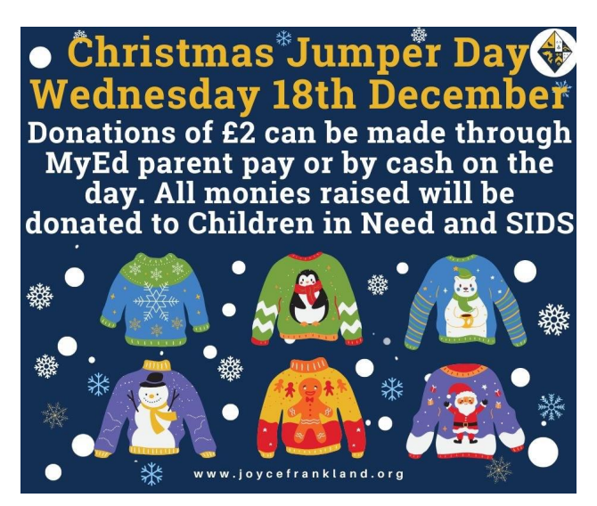
3 - Christmas Jumper day