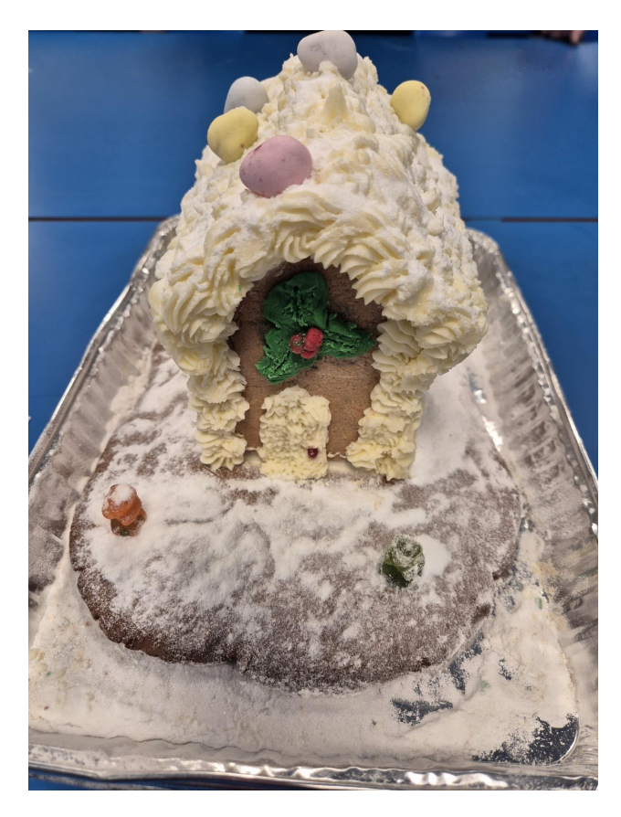
5 - Bake Off