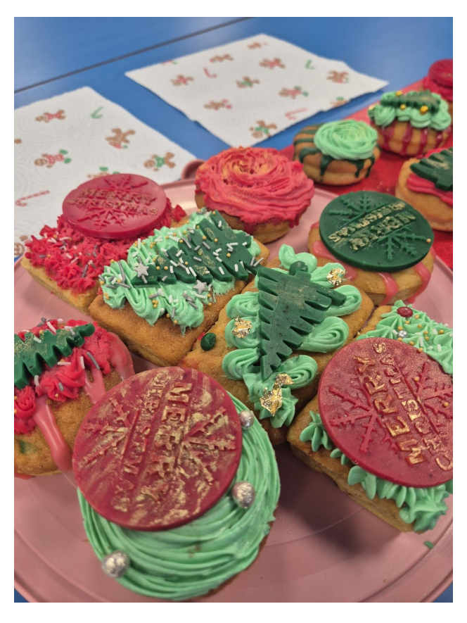
9 - Bake Off