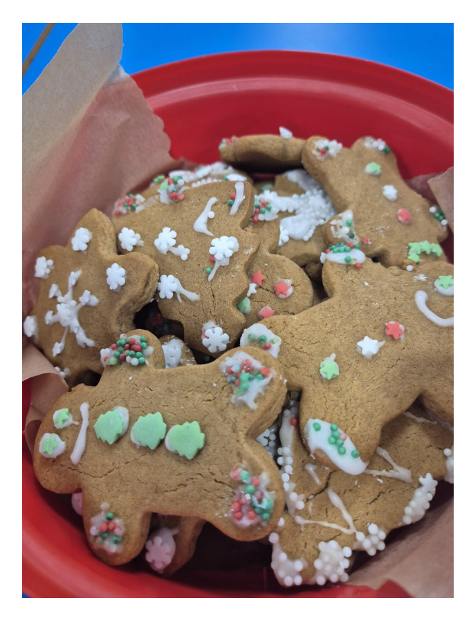
7 - Bake Off