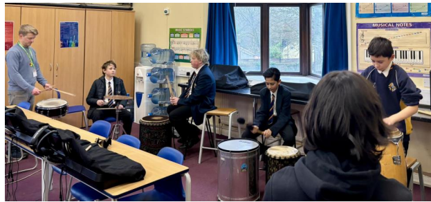
6 - Percussion Group