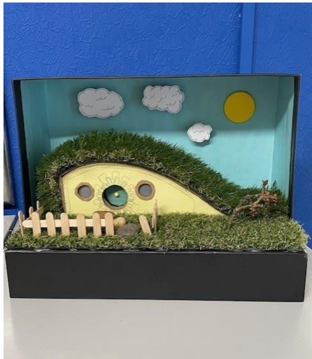
4 - Luca N