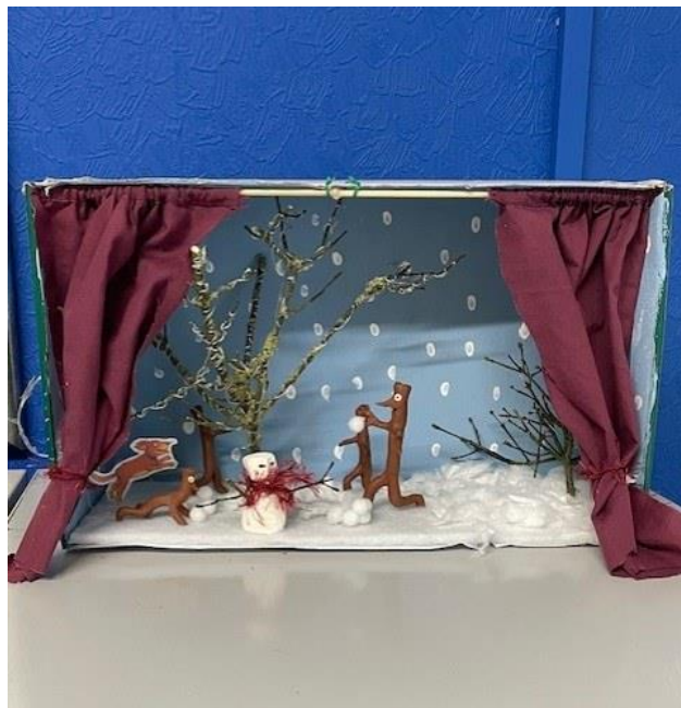
2 - Jasper J