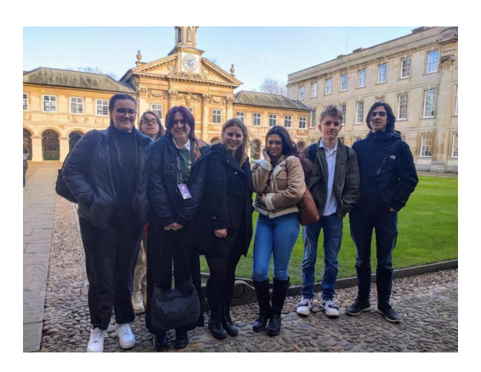
1 - Year 12 trip to Emmanuel College