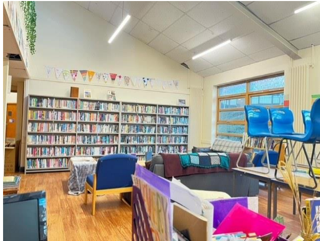
5 - Library