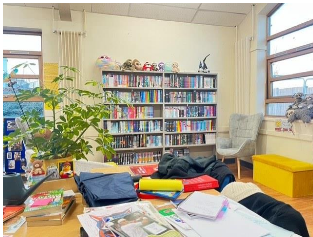
6 - Library