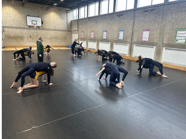
4 - Dance Workshop