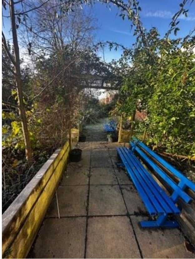
2 - Four raised flower beds and bench