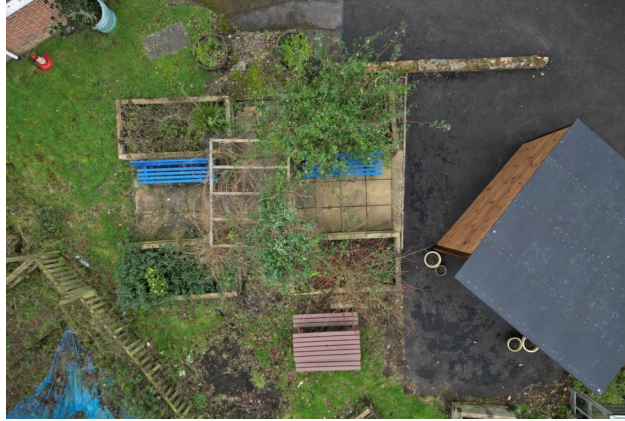
4 - Aerial view