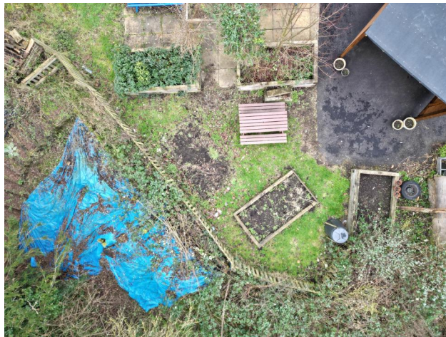
3 - This area has now been cleared