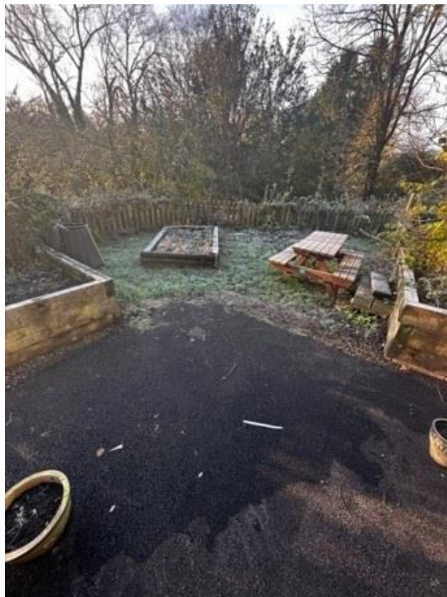
1 - Raised beds and compost area