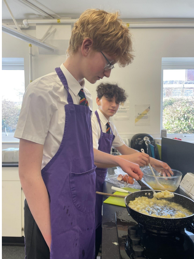
9 - Year 8 pupils making Spanish Tortillas