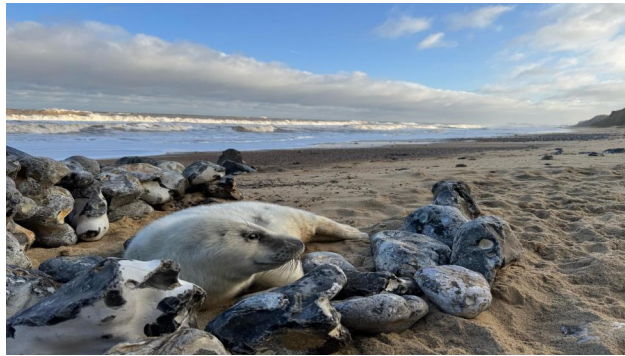
15 - Highly Commended Intermediate Stage Ferris W