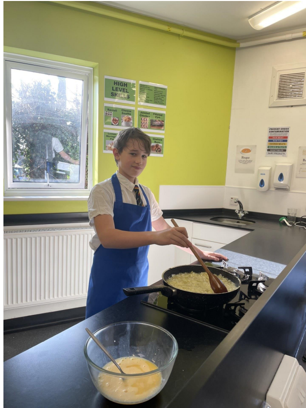
10 - Year 8 pupils making Spanish Tortillas