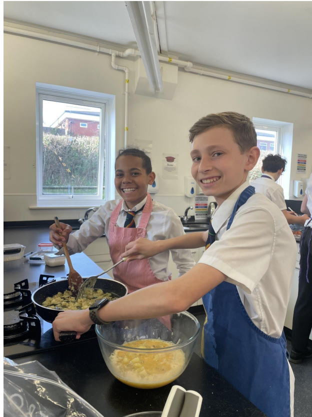
8 - Year 8 pupils making Spanish Tortillas