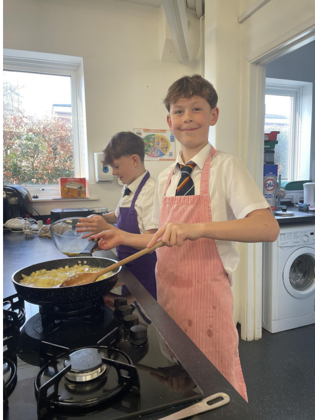
11 - Year 8 pupils making Spanish Tortillas