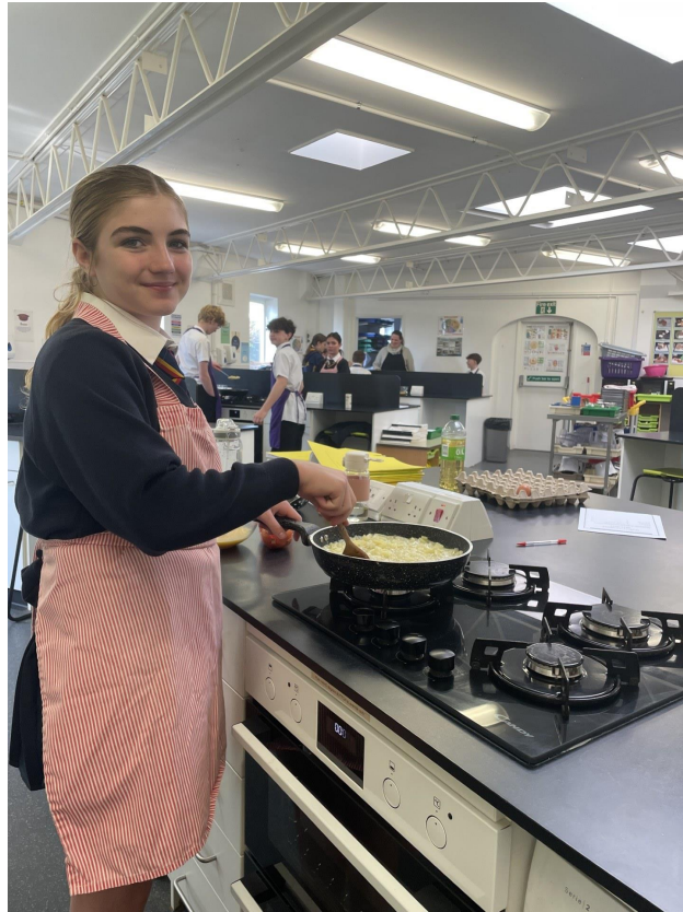
7 - Year 8 pupils making Spanish Tortillas