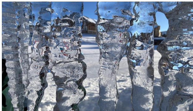
12 - Intermediate Stage Winner Olivia H