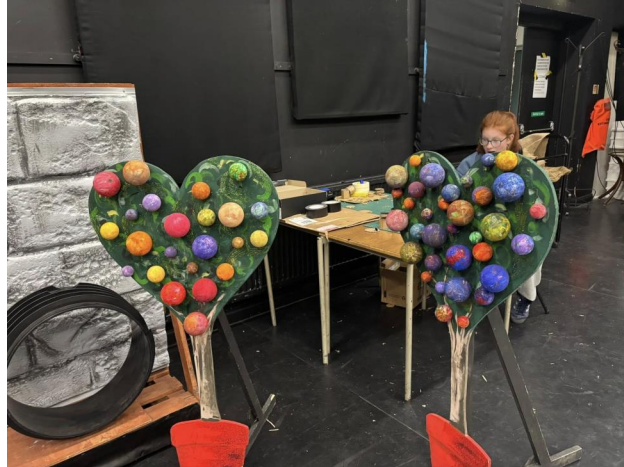
9 - Charlie and the Chocolate Factory