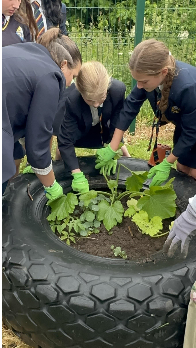
4 - Eco Garden opening ceremony