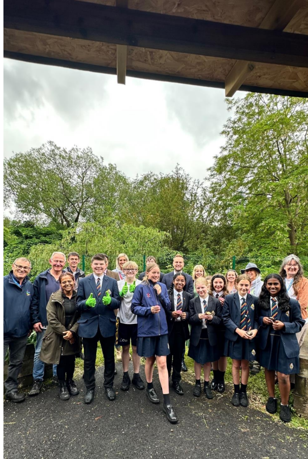
2 - Eco Garden opening ceremony