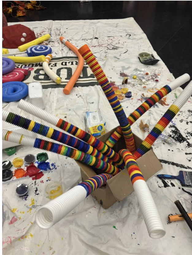
7 - Charlie and the Chocolate Factory