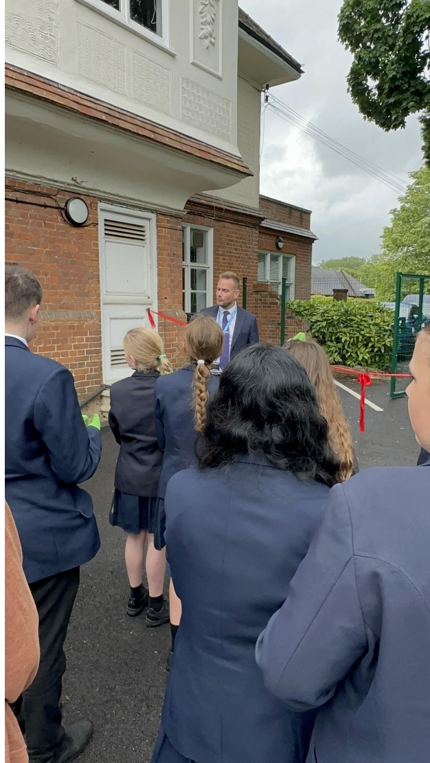
3 - Eco Garden opening ceremony