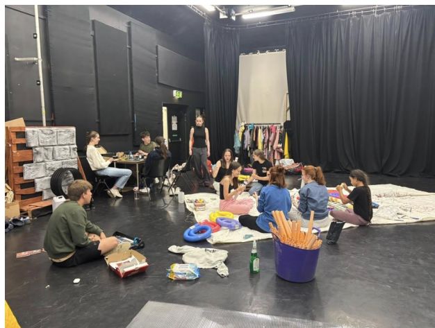
8 - Charlie and the Chocolate Factory