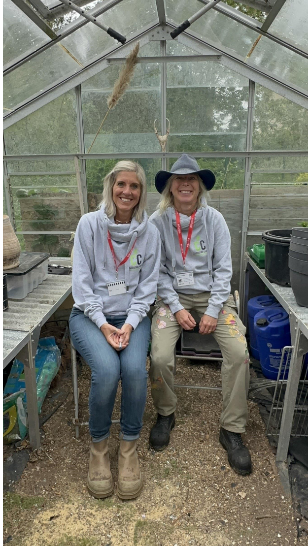
5 - Eco Garden opening ceremony - Cultivating change