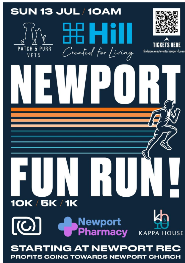
1 - Newport Fun Run