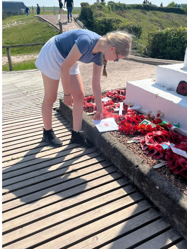
9 - Lochnagar Crater