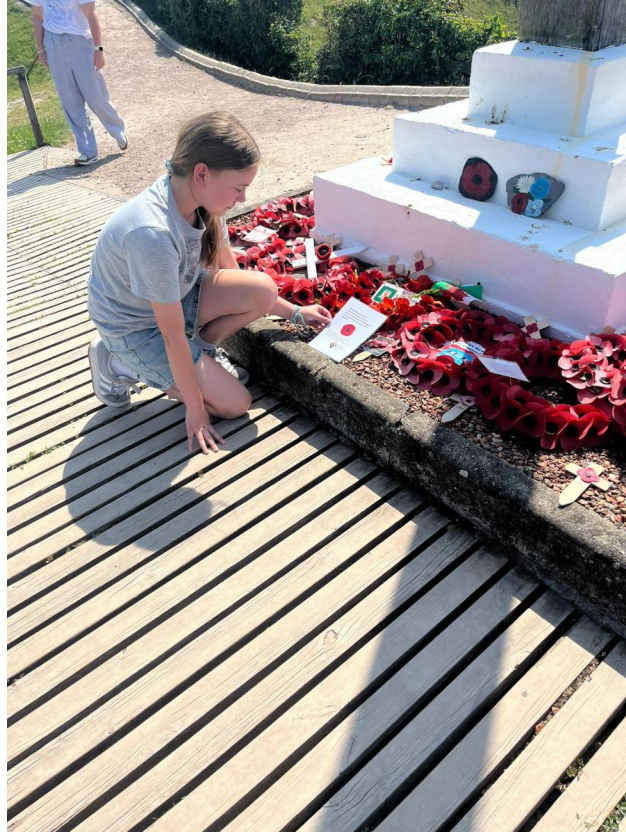
8 - Lochnagar Crater