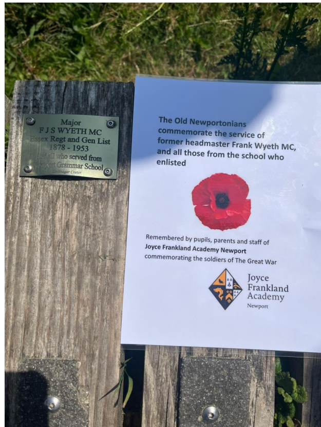
10 - Plaque at Lochnagar Crater