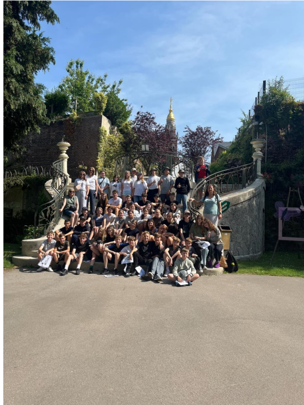
6 - Year 8 pupils and staff in Albert, in front of the Basilica