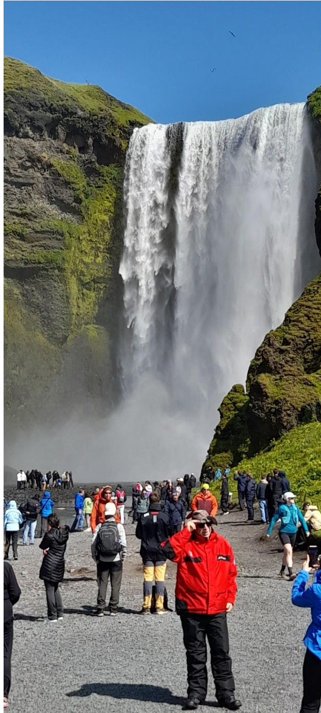
3 - Iceland Trip