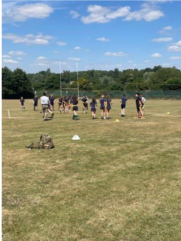
5 - Year 8 STEM Day