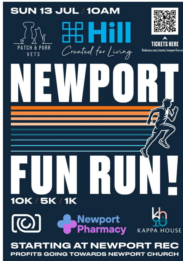
1 - Newport Fun Run