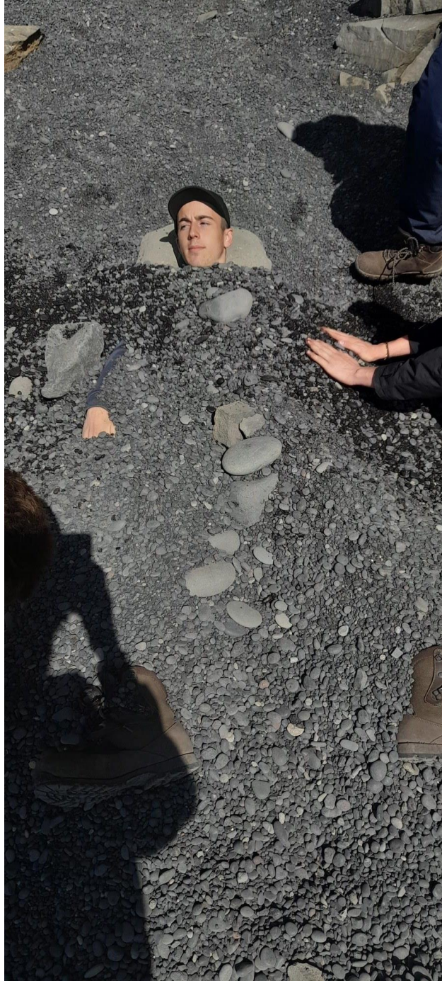
2 - Iceland Trip