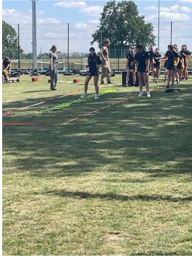
4 - Year 8 STEM Day